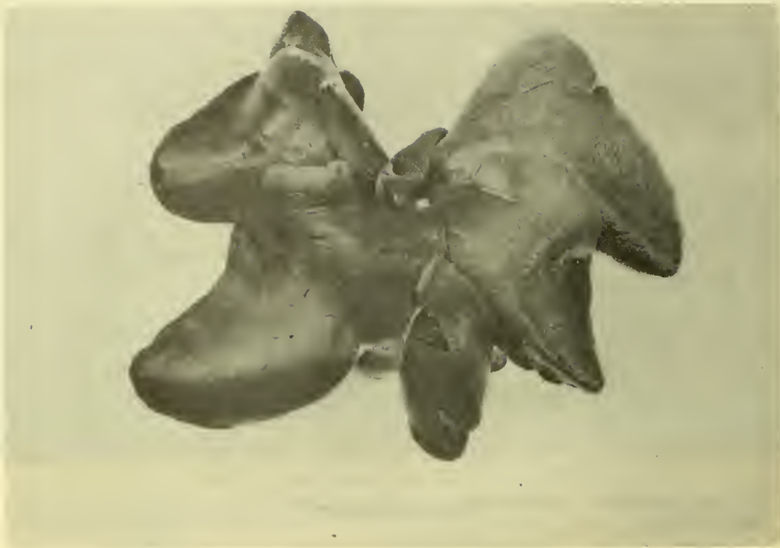
Liver of bachelor fur seal 3-5 years old, St. Paul Island, Alaska, June 30, 1947. Weight of liver with gall bladder 1,381 grams (3.04 pounds). (Photo VBS 2191)