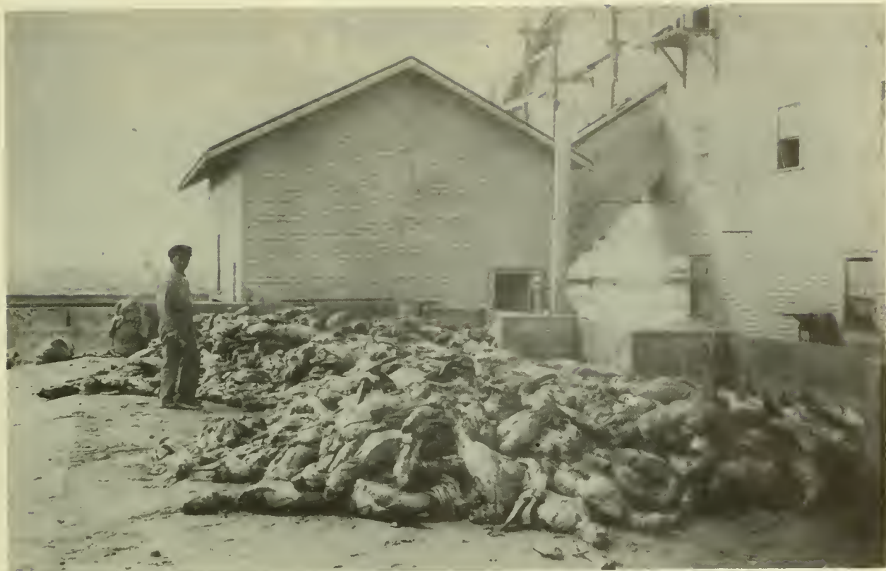
Fur seal carcasses at byproducts plant, St. Paul Island, Alaska, July 15, 1948. (Photo VBS 2409)