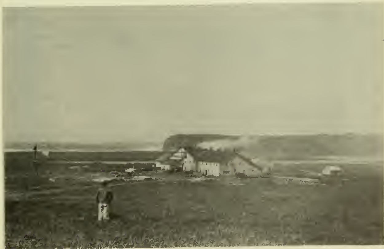
Byproducts plant, St. Paul Island, Alaska, July 26, 1948. (Photo VBS 2414)