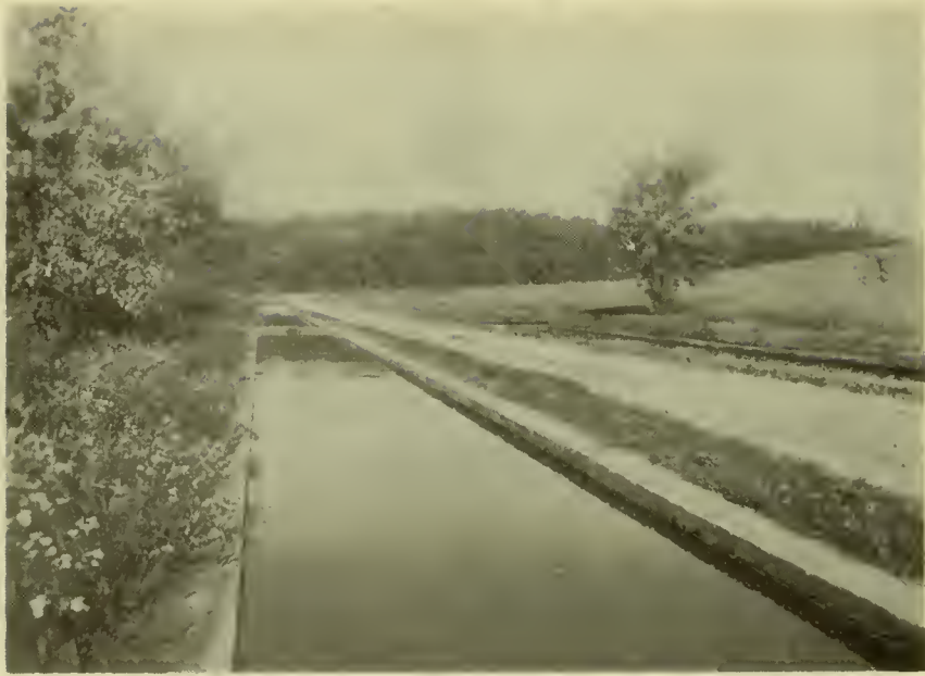
Figure 3.--The D series of trout raceways at Leetown.