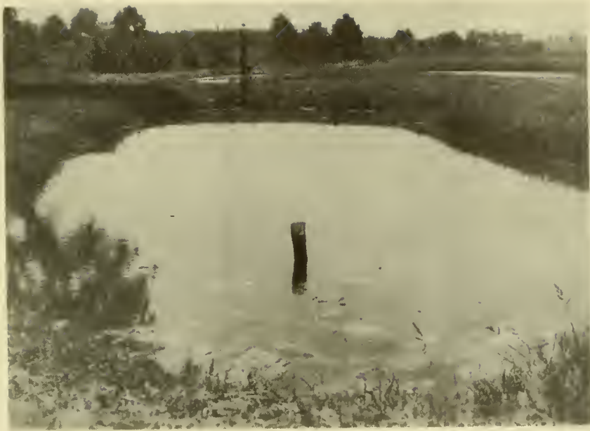
Figure 1.—One of a series of dirt-bottomed ponds used for DDT experiments.