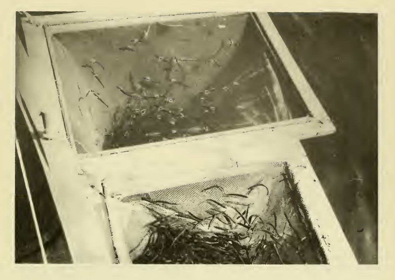
Figure 2.--Holding pockets used in testing the Maine sardine tag. The lower pocket contains untagged fish; the upper, tagged fish.

Herring selected for tagging were in the 5- to 6-inch total length group. Fish of that size group are especially sought by the sardine fishery and, when tagged in the late summer and autumn, offer an opportunity for overwintering and recovery the following year. The dorsal musculature of a 5- to 6-inch herring is well-formed and holds the tag well, whereas smaller fish of about 4 inches show distress and inability to sound when the tag is attached.