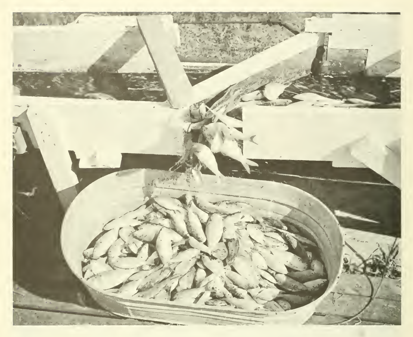
Figure 2.—Closed gate forcing fish off conveyor belt into a tub.

menhaden fishermen, however, often remain at sea for several days fishing over a wide geographical area. Hence, our electronic detector-recovery system adapted for operation aboard fishing vessels was thought to be the best means of obtaining reliable menhaden migration data in the Gulf. We have not yet resolved the technical problems of application of this system to use on vessels. The major problem is not detection of tagged fish as they are pumped aboard, but retrieval of the fish once it has been detected. Results from tags recovered by magnets in the Gulf now indicate that reliable estimates of the interchange of fish between fishing areas, growth and mortality rates, and the importance of certain estuaries in the production of menhaden may be obtained from these data. Thus, it may not