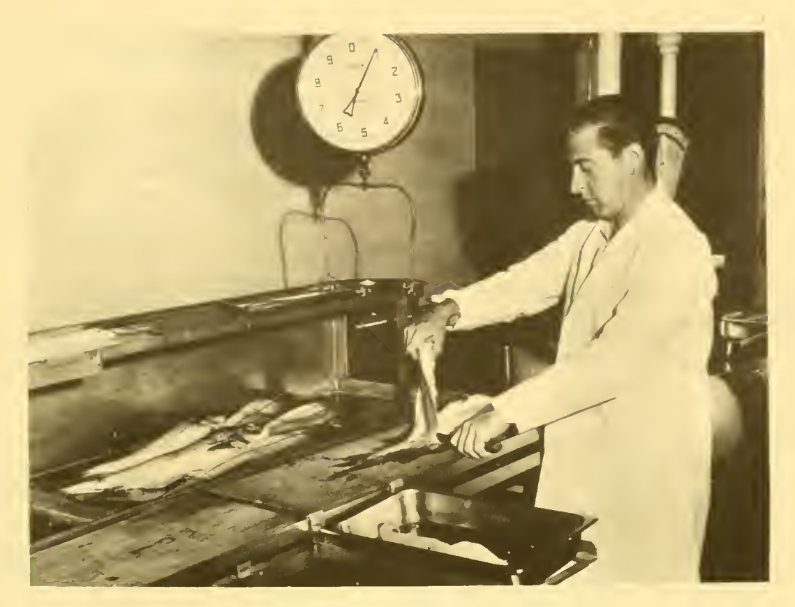
Filleting fresh haddock preparatory to preservation by radiation.