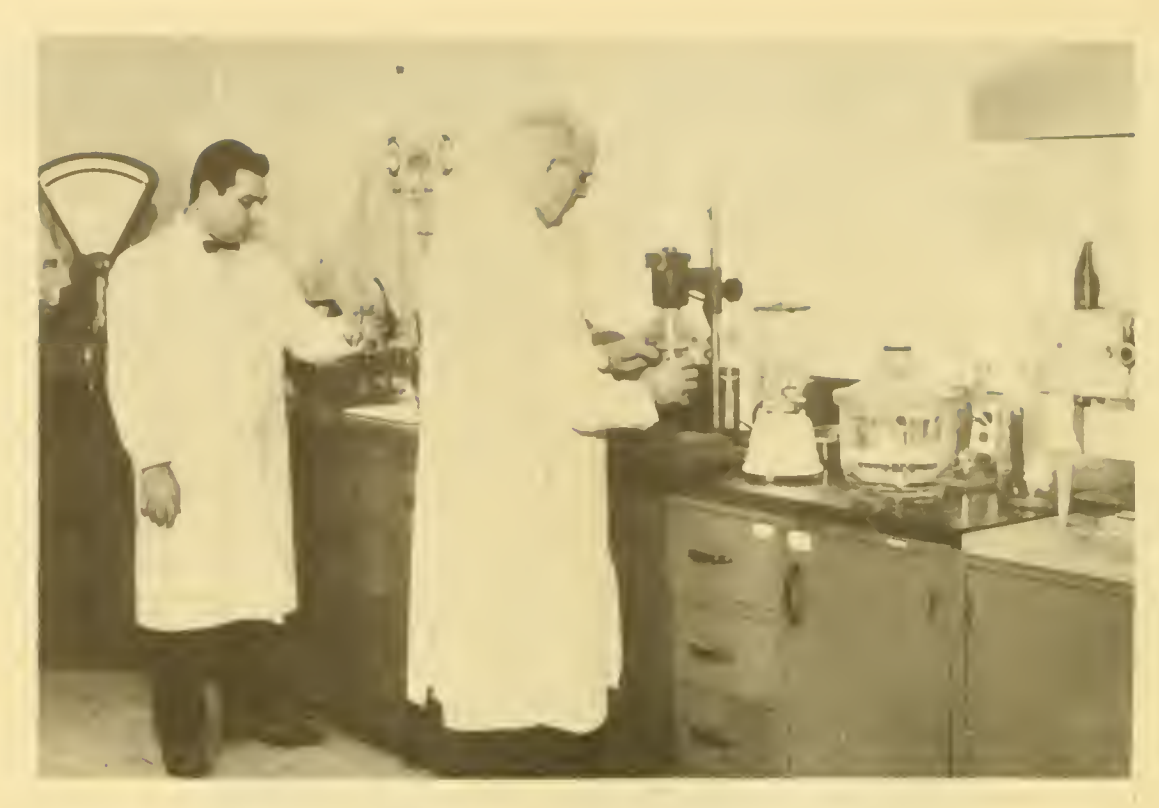
The analytical chemistry laboratory where studies are made of the composition of North Atlantic fish and shellfish.

practices. Newer standards or revisions are being simplified in application without sacrificing their objectivity in order to aid inspectors in grading several types of products each day.