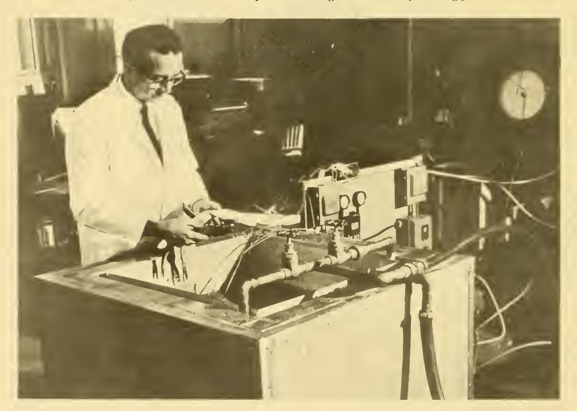
Examining whiting stored in 30° F. refrigerated sea water.