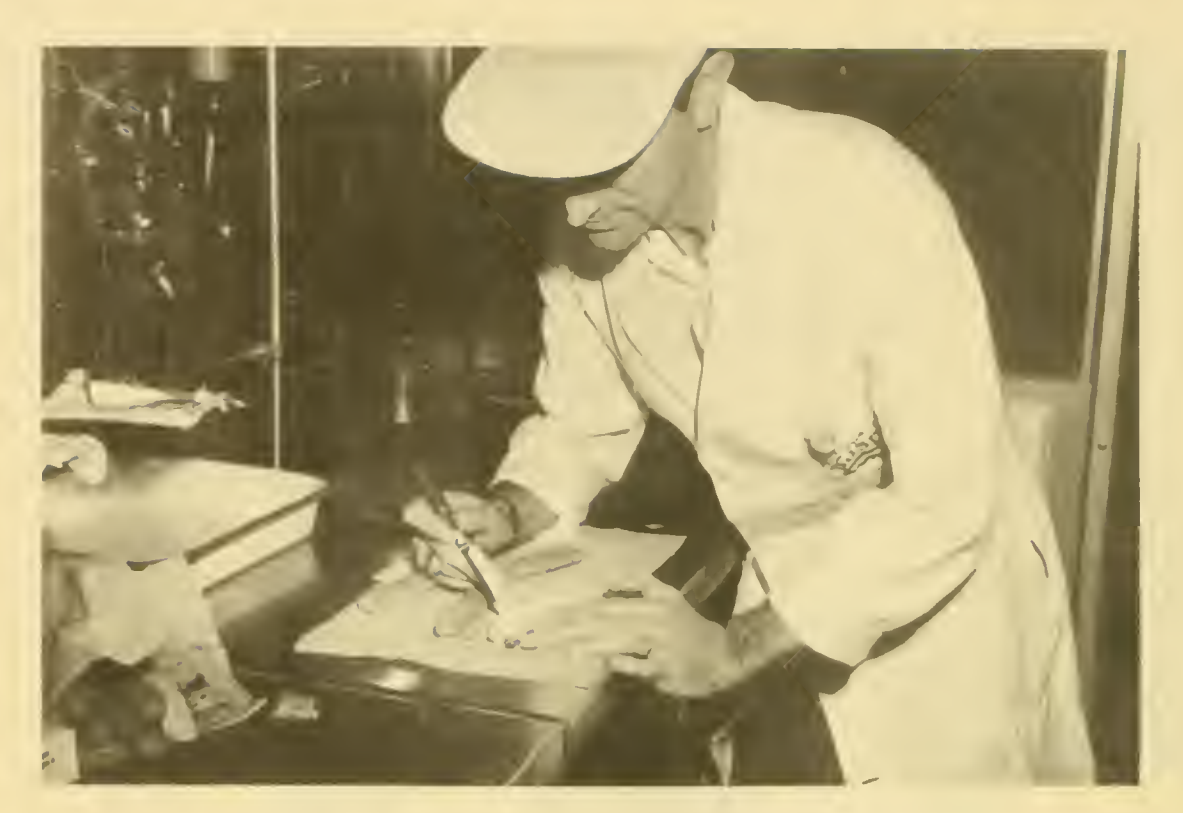
A U.S. Department of the Interior inspector examining fish sticks in a processing plant.