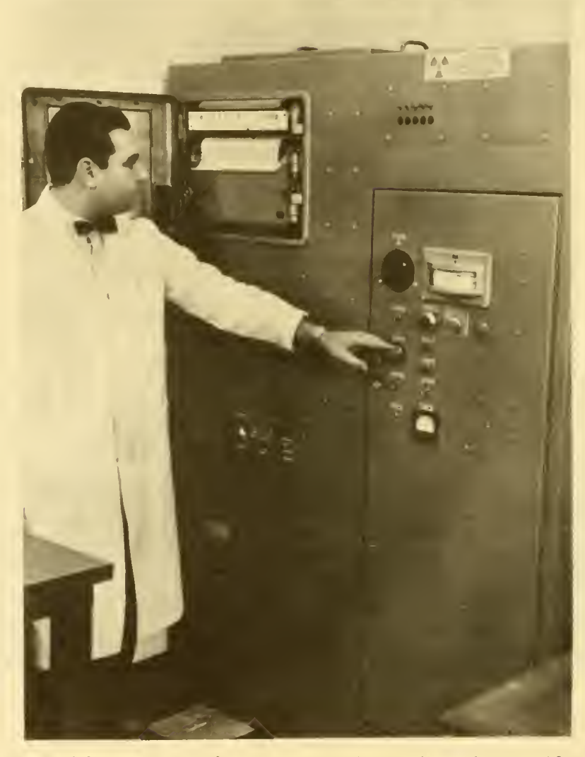
Using the gas chromatograph for the separation of volatile compounds that contribute to the odor and flavor of fresh haddock.

Gas chromatographic and mass spectrometric techniques are being used to isolate and identify those compounds that are