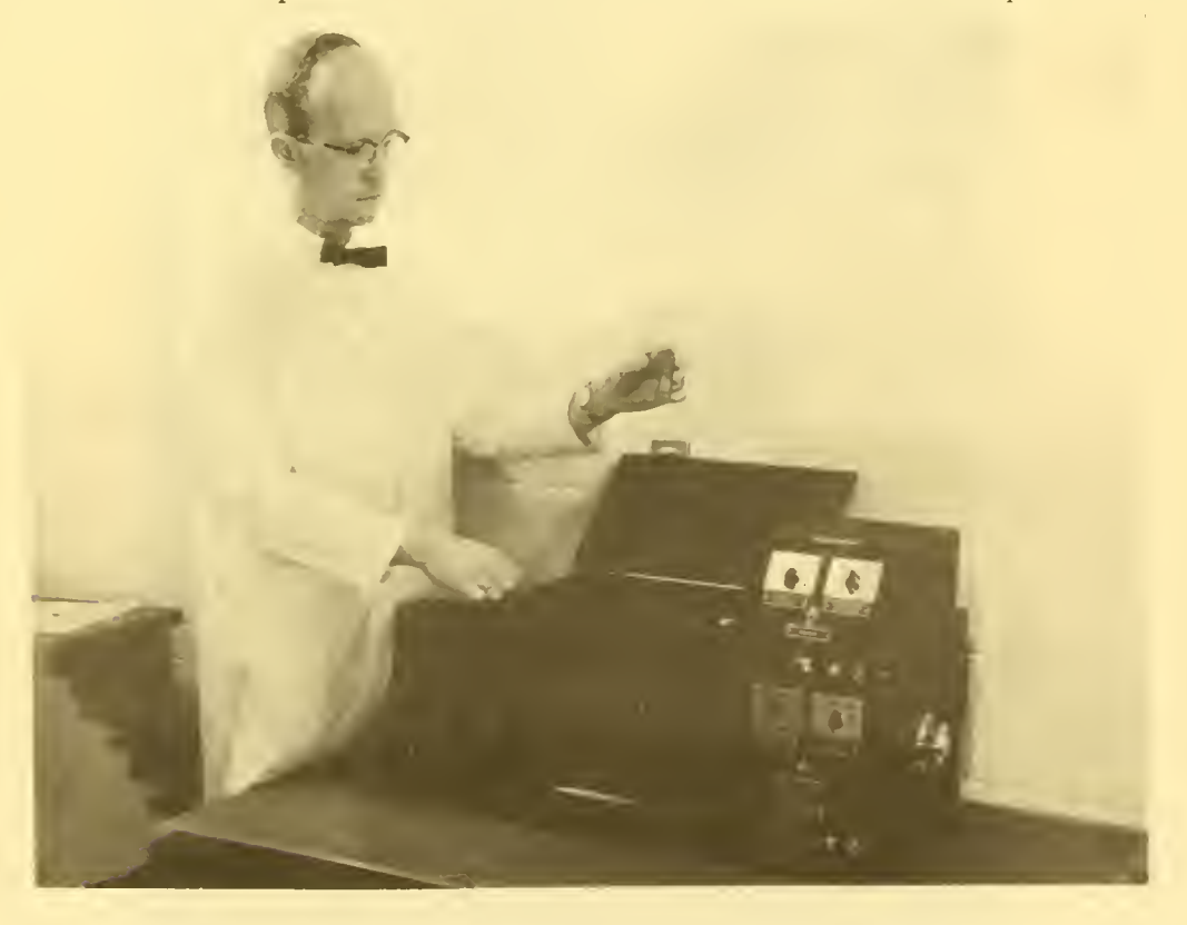
Making light-scattering measurements to determine the effect of frozen storage on the size and shape of actomyosin molecules from cod muscle.

Our studies on the chemistry and biochemistry of fish are of a fundamental nature and are concerned with the denaturation of proteins in frozen fish, isolation and identification of the compounds that cause