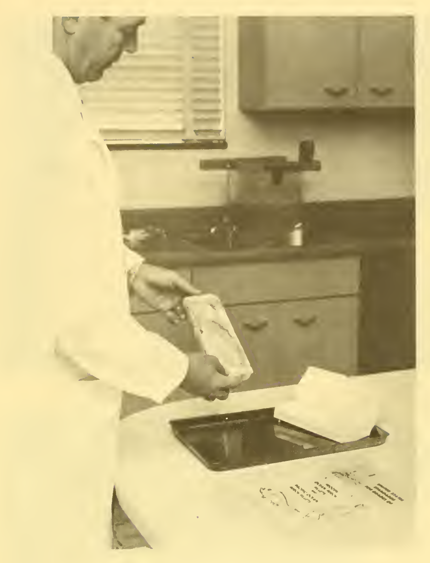
Grading of ocean perch fillets using grade standards.

and Middle Atlantic areas has its headquarters at the Gloucester laboratory. At present, 10 plants in the area from Maine to Maryland are using the Department's continuous inspection service, thus putting into direct use the standards of quality developed at Bureau laboratories. During fiscal year 1961, 60 million pounds of fishery products in the North and Middle Atlantic areas were given the Department's quality approval, either under continuous or lot inspection.