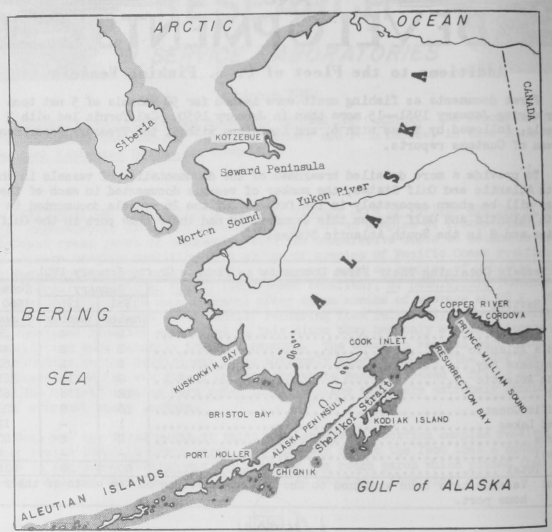
ALASKA (SEE OTHER CUT FOR SOUTHEASTERN ALASKA)

while the use of set nets above the drift gill-net markers has been prohibited. This, in effect, permits set-netting along the shores of the bay wherever drift-netting is permitted. Also the set-net regulations have been relaxed to allow operations anywhere in the intertidal zones instead of confinement to a narrow strip of beach adjacent to the high-tide line, as in 1950.