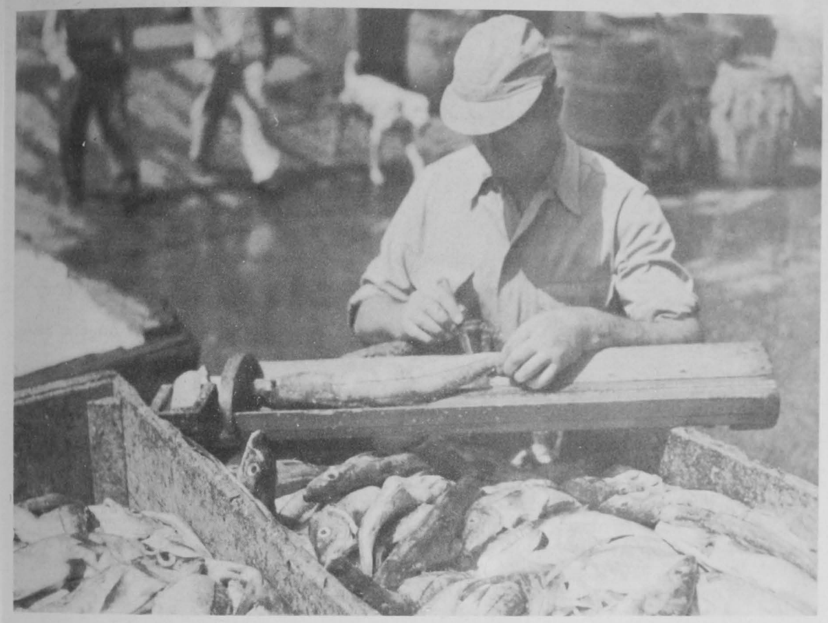
FIGURE 3 - OBTAINING SCALES FROM HADDOCK AT THE BOSTON FISH PIER FOR AGE DETERMINATION.

We have been able to assess the ages of haddock landed by examination of the scales collected at the Boston Fish Pier (Figure 3). Of all scrod landed from Georges Bank in 1950, 85 percent were 2-year-olds. In the average year only 47