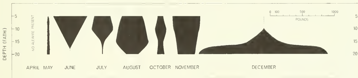
Figure 2.--Availability of alewives to bottom trawls in Green Bay by depth and month April - December. Figures illustrate the catch rate of alewives at 5-fathom depth intervals.

1 T = Trace, less than 0.5 or 0.05. 2 Not calculated.