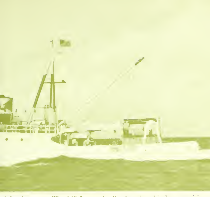
Atlantic waters. The 143-foot, twin diesel-engine ship has a cruising range of 9,500 miles and carries 27 people.

in press) of more than 80 scientific papers. The atlas is scheduled for publication by the American Geographical Society.