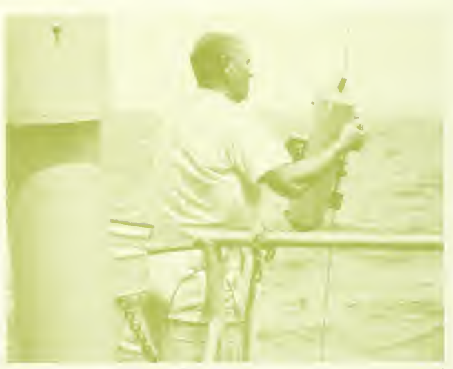
The beginning of a Niskin cast on the Undaunted. Several of these bottles are lowered to record water temperatures and chemical components of sea water at different depths.