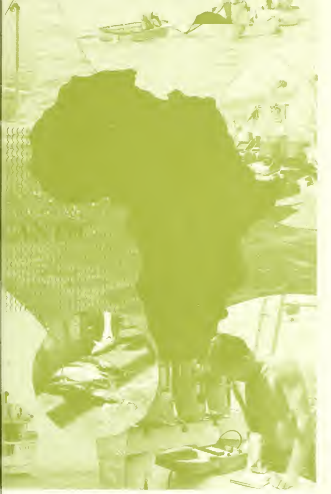
sts and some of the research operations.

The national objectives of the Bureau of Commercial Fisheries are to: