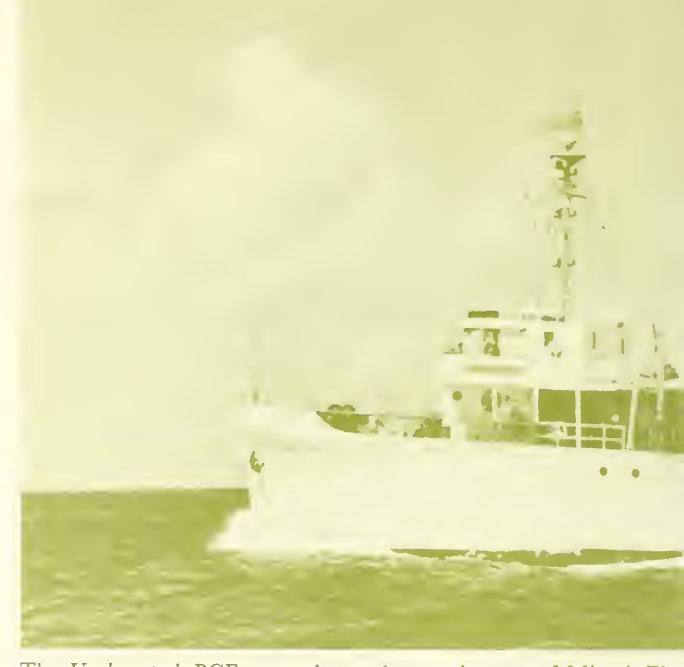
The Undaunted , BCF research vessel operating out of Miami, Fla. for TABL, as she departs on one of her frequent cruises in tropical

UNESCO's Intergovernmental Oceanographic Commission. The finding of potential commercial quantities of tuna and other fishery resources made it feasible to continue investigations in the area of the Gulf of Guinea.