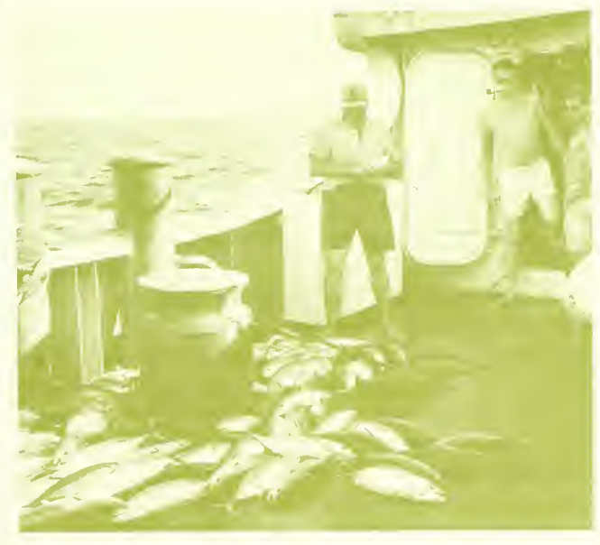
A deck sample of 25 skipjack tunas caught by Undaunted fishermen off St. Vincent Island, B.W.I., winter 1966.

Visiting investigators are welcome. Limited space is available for observers on research cruises. Arrangements should be made by correspondence with the Laboratory Director.