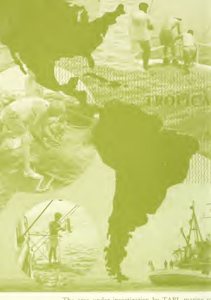
The area under investigation by TABL marine so