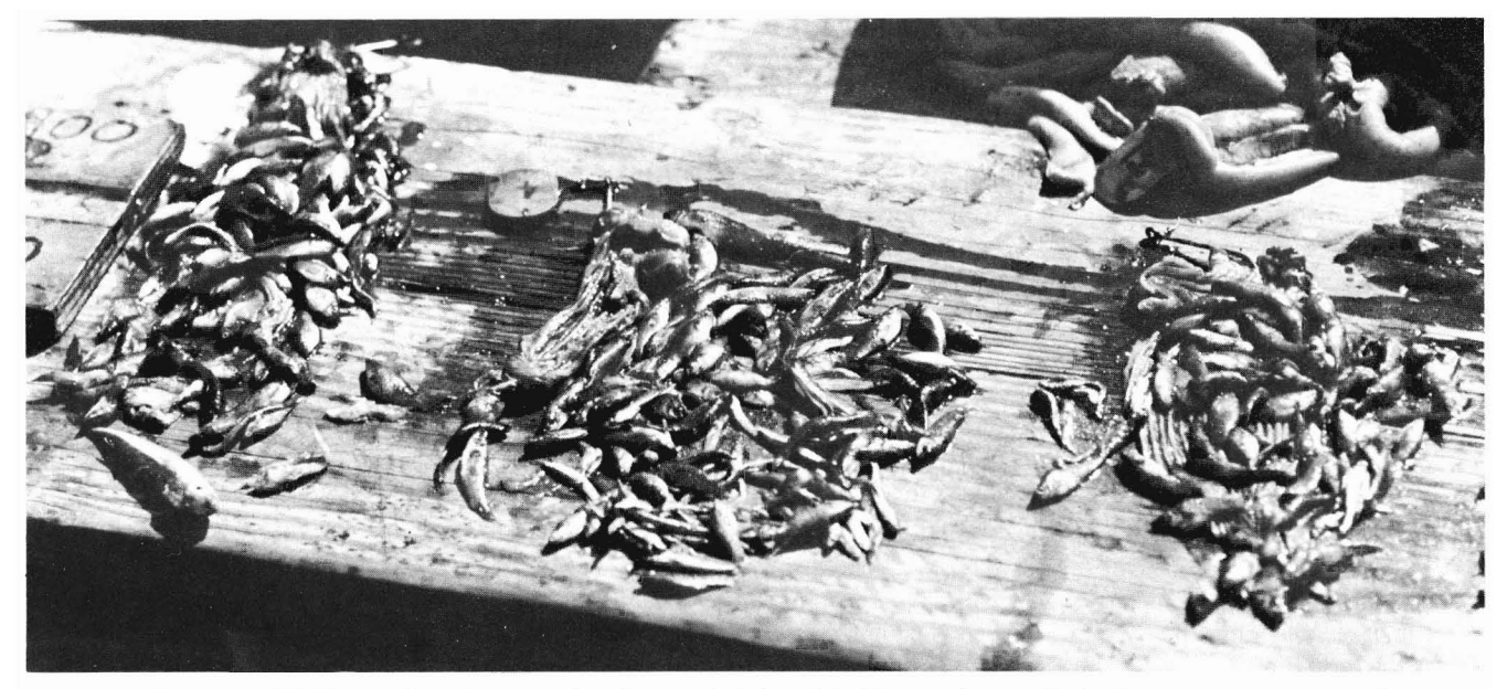
Figure 4.—Mollies cut from the stomachs of tuna poled aboard the Hatsutori maru. Each pile represents one stomach.

(Smith, 1977). Sprat are generally regarded as an excellent baitfish (Baldwin, 1977; Wilson, 1977; Smith, 1977), but fragile (Baldwin, 1977; Wilson, 1977). In this regard, we kept S . delicatulus alive for 3 days but mortality was high and increased with time.