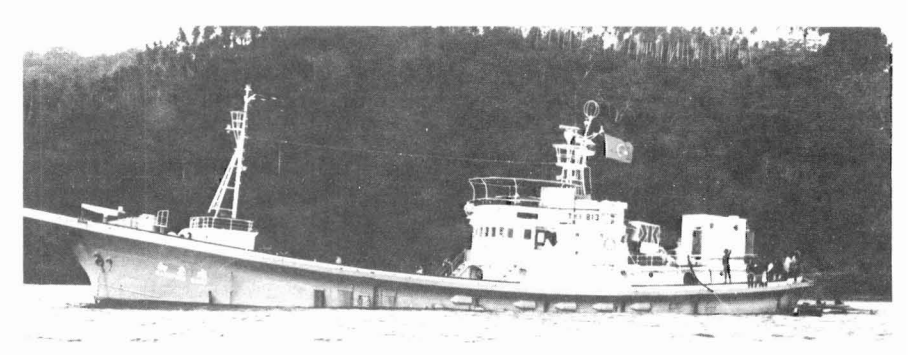
Figure 2.—Japanese live bait pole-and-line fishing vessel, Hatsutori Maru . Name on vessel is misspelled.

To load the baitfish into the baitwells, the receivers were brought alongside the vessel and the baitfish transferred with buckets. Approximately 373,000 mollies (507 kg) were loaded aboard the Hatsutori Maru on 16 June and another 134,000 (202 kg) were loaded on 21 June (total, 710 kg). Two size groups were represented: Baitwell No. 1 contained about 66,000 (46 kg) smaller mollies ( \bar{x} SL = 27.0 mm; \bar{x} WT = 0.7 g)<sup>2</sup>. The other four wells contained about 442,000 (663 kg) larger mollies ( \bar{x} = 36.2 \text{ mm}; \bar{x} WT = 1.5 g).