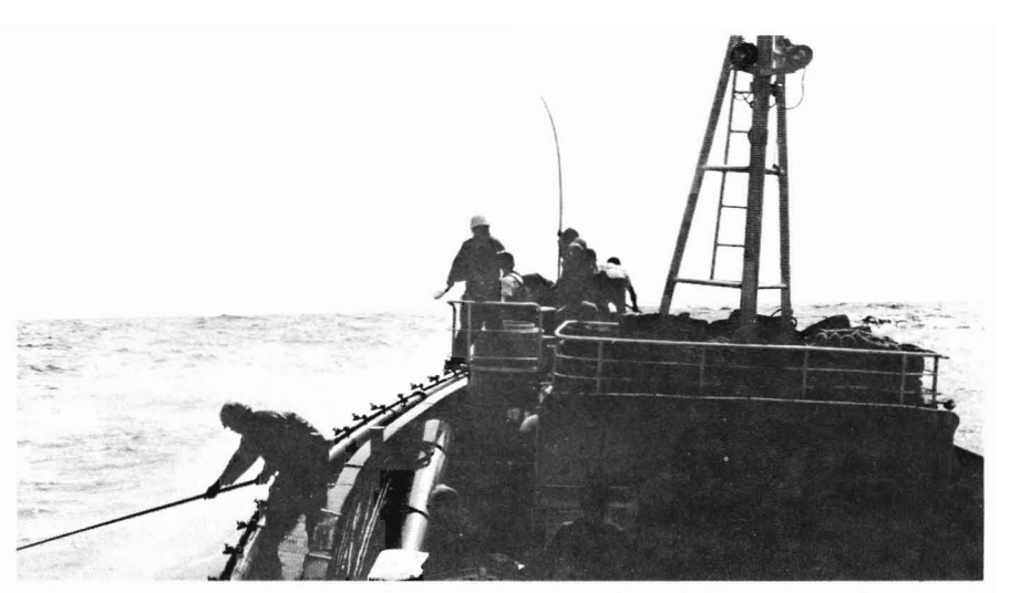
Figure 3.—Spray system along the port gunwales of the Hatsutori Maru . Chummer has just thrown some live mollies.

There are two chumming stations on board the Hatsutori Maru ; one tank (station) is located on the port bow and the other on the port stern. Bait was transferred from the baitwells to the chumming tanks in buckets as needed. Usually, chumming commenced from both stations as the vessel approached a school of tuna. When the fish were observed to break at the surface along the "chum line," the vessel was slowed