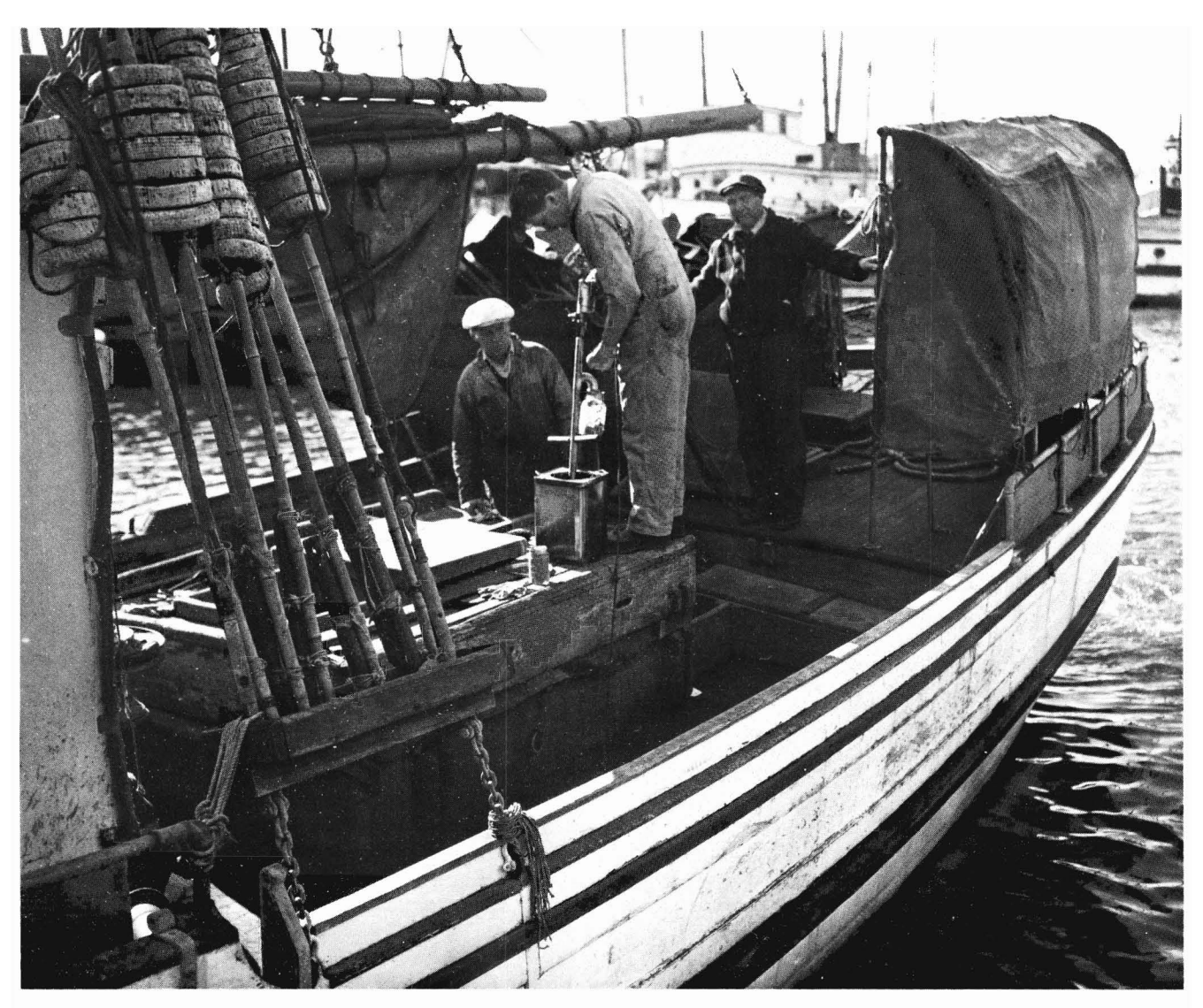
Research technologist Charles Butler demonstrates to fishermen the sampler developed by the Seattle laboratory for taking a representative sample of fish livers for vitamin A assay (Utilization Research Division photo, 1948).

This is not to say that by 1937 the subject of analysis and composition was of little further interest to fishery chemists. Quite the contrary. The increasing utilization of various species, the need for composition in relation to size and biological condition, and the interest of nutritionists in detailed data on organic and mineral constituents in food products were major factors in expanding the field of fish analysis and composition.