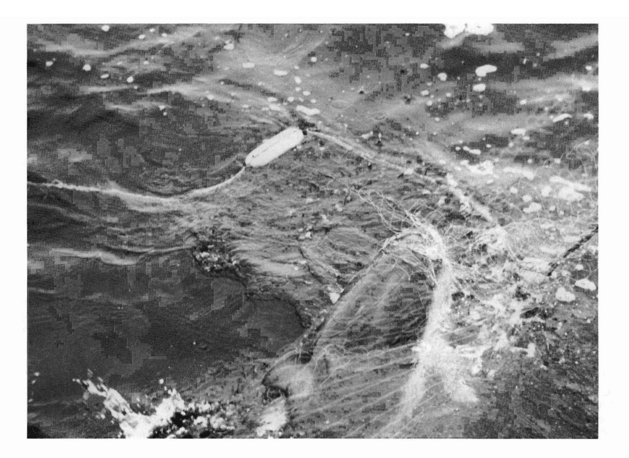
Figure 2.—(Facing pages) A series of photographs of a Lagenorhynchus obliquidens entangled in a driftnet. Note the cut on the trailing edge of the dorsal fin in the photograph on the bottom right. 15 August 1991, at lat. 44°21.3'N, long. 177°45.0'W.