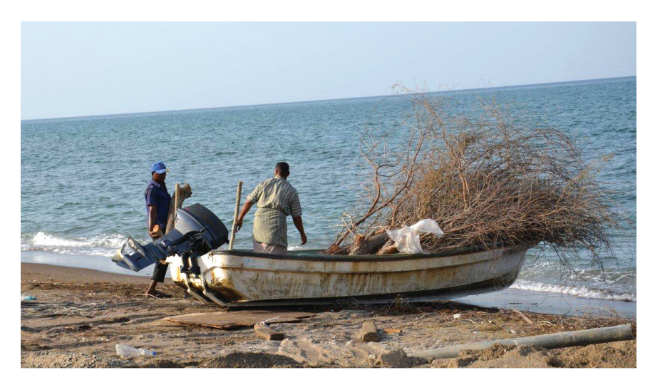
Figure 5.—Fishermen utilize shrubs and logs as artificial reefs to attract fish.

Results revealed that 10 percent of the fishermen's income was explained by having good relationships and open communication with extension services. Therefore, fishermen who have a weak relationship and poor communication with the extension service could improve their operations and financial outcomes by strengthening their relationships and communication with the service. Interactions with extension personnel lead to better knowledge of fishing areas, particularly the places where artificial reefs have been planted, awareness of better tools and technology, financial schemes of the government and the development banks, and in realizing some promising opportunities. A lack of such knowledge forces fishermen to devise their own methods to attract fish (e.g., use of shrubs and logs) (Fig. 5). Results also showed that the odds of fishermen being in the high-income category increase manifoldly (approximately 8 times as revealed by an odds ratio of 8.737) with an increase in "Fishermen's involvement in the extension activities of the MAF."