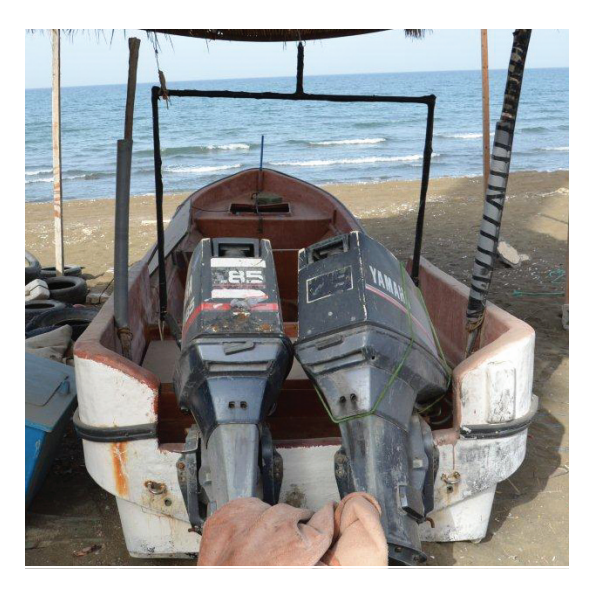
Figure 2.—A typical two-engine fiberglass boat used on the Batinah Coast.

(Ocheiwo, 2004; Tzanatos et al., 2006; Belwal et al., 2012). Alhabsi (2012) observes that the level of income of the fishermen on the Batinah coast of Oman depends on the fishing gear that they use and the region where they fish. According to her, the fishermen who used beach seine and encircling nets belonged to a higher income category than those who used lines and traps. According to Alhabsi (2012), the majority of the low income fishermen belonged to the Shinas and Liwa regions of the Batinah coast.