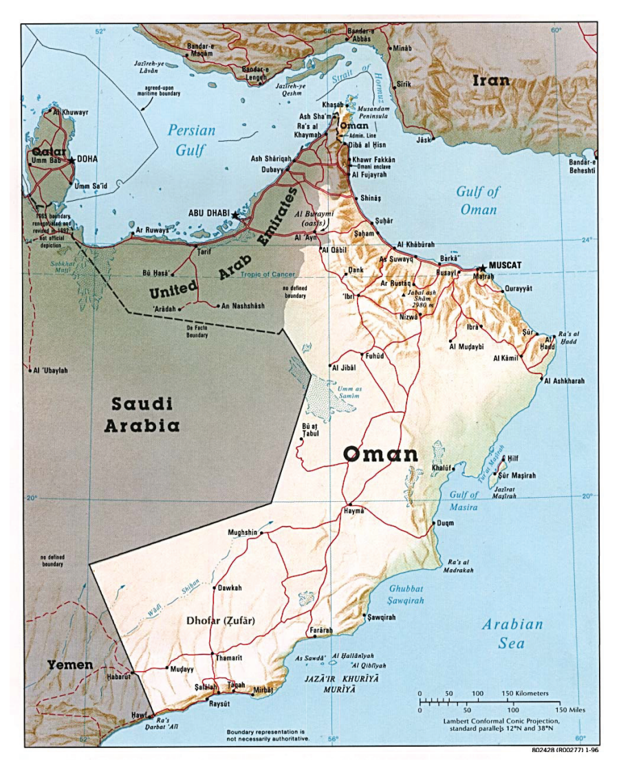
Figure 1.—Oman's Batinah coast: the northern coastal strip along the Gulf of Oman. (Source: http://athaia.org/oman-map.html oman_relief.jpg).

Statistical data (MAF, 2010) reveals that around 40 percent of Batinah fishermen reside in the southern Wilayat of Barka, Masana'a, and Suwaiq, while the remaining 60 percent reside in the northern Wilayat of Shinas, Liwa, Sohar, Saham, and Khabora. These fishermen mainly depend on the fish landings on the Batinah coast for their subsistence (Belwal et al., 2012).