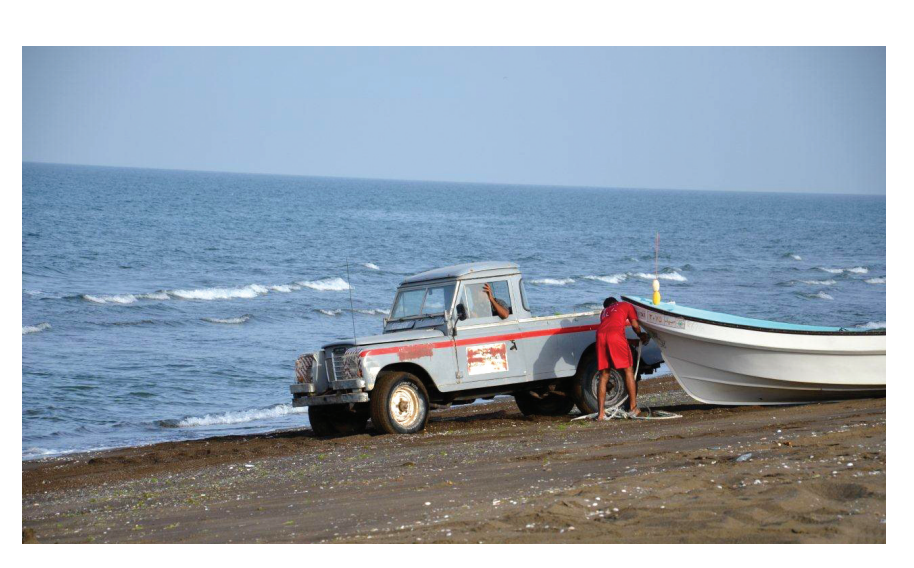
Figure 3.—Fishing inputs: use of truck in towing boats to and from the coast.

Furthermore, the role of demographic and socioeconomic variables (i.e., age of fishermen, literacy, relationship with crew, boat ownership, partnership in other boats, income sharing, and alternative sources of income) in determining income is important to explore. It is also important to explore the relationship between fishermen's income and their participation in the extension activities of the government. Although it has been observed that a passive attitude towards participation among fishermen's groups reduces the chances of success for fisheries regulations, whether this applies vice