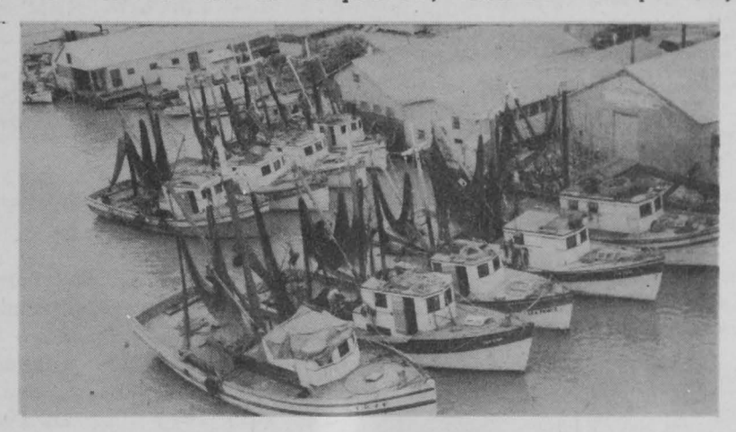
PART OF THE MORGAN CITY SHRIMP FLEET, TIED UP BEFORE THE BLESSING

In spite of high construction costs, a large number of new fishing vessels entered the fisheries. During 1947, according to the U.S. Bureau of Customs,