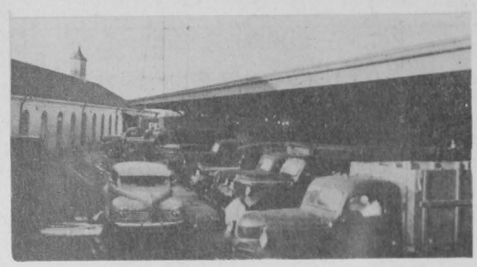
NEW ORLEANS' FRENCH MARKET AT 6: 15 P.M. -- BEFORE NIGHTLY ACTIVITY STARTS

leans French Market ranged from $15.00 to $90.00 a barrel (210 pounds, heads-on) during the first half of the year and from $27.00 to $90.00 a barrel during the