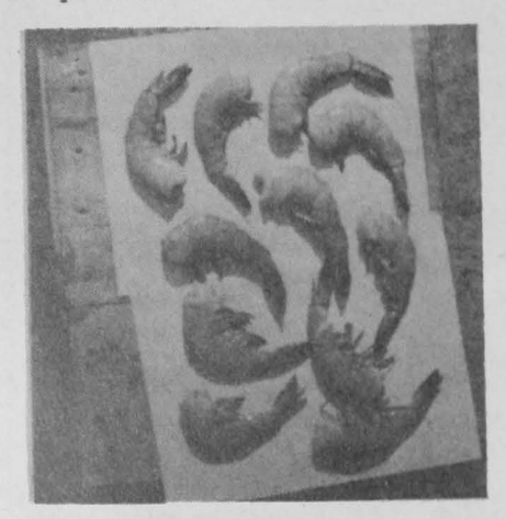
ONE POUND OF SHRIMP

Of the 302,453 barrels of shrimp landed in certain principal Gulf ports in 1947, about twothirds were utilized for the fresh and frozen trade and the remaining one-third were used for canning (Figure 2). The same utilization ratio applied to