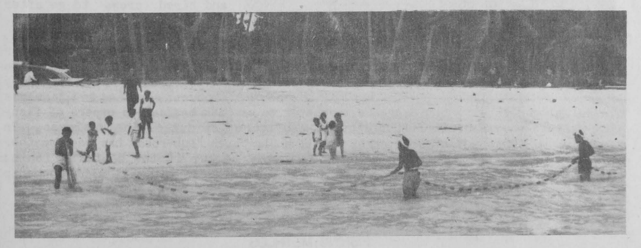
FIG. 1 - NATIVES START DAY WITH A FISHING EXCURSION INTO THE SURF USING A BEACH SEINE

Recent information from the Philippine Bureau of Fisheries indicates that the 1947 fish catch by commercial fishermen amounted to 84,727,618 pounds. There was quite a vigorous upward trend in the increase of commercial fishing during 1947. It is evident that progress is being made in the rehabilitation of the fisheries, but considerable work still needs to be done to get the yield back to the prewar total.