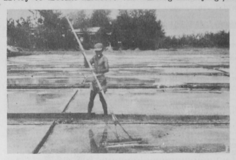
FIG. 10 - PRODUCTION OF SALT BY THE SOLAR EVAPORATION PROCESS.

In the absence of adequate means of distributing fresh fish, salting and drying of the catch must be resorted to in order to preserve the catch for delivery to distant markets. The salting and drying procedures used are crude, and,