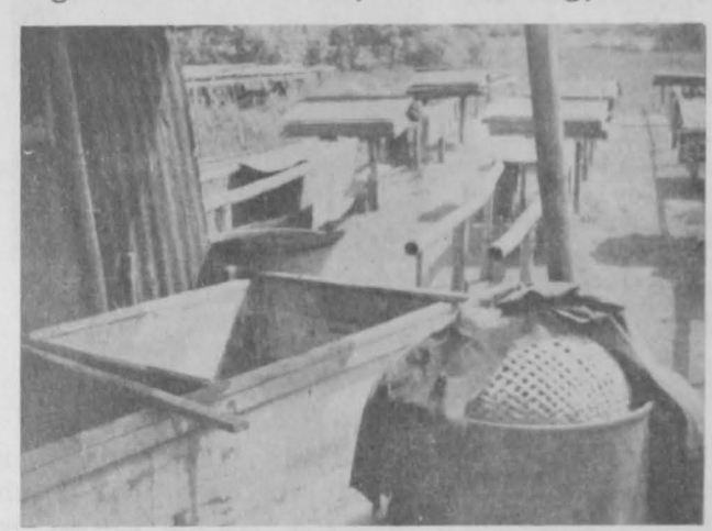
FIG. 8 - FISH DRYING YARD, NAVOTAS, SHOWING DRYING RACKS IN REAR, FISH BRINING TANK IN LEFT FOREGROUND, AND 50-GALLON OIL DRUM CONTAINING FISH PASTE IN RIGHT FOREGROUND.

Patis, a clear, straw colored liquid, should also be classed as a salt fish product. The better grades are prepared from anchovies, goby fry, small shrimp, or gizzard shad which, after washing, are mixed with salt in approximately the same