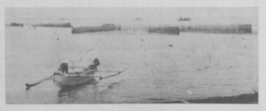
FIG. 3 - TYPICAL PHILIPPINE FISH TRAP

Trap-caught fish form the basis for a business carried on by one enterprising operator. He has a YP procured as surplus from the Navy. The ship had been used