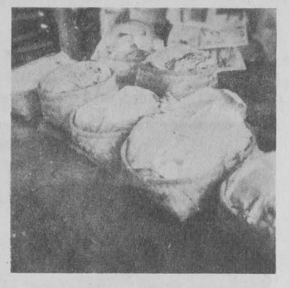
FIG. 7 - BASKETS CONTAINING ICED FISH READY TO BE SHIPPED FROM BATANGAS TO MANILA BY TRUCK,

Medium fish are split along the back, eviscerated and laid open, before salting and drying. Large fish are split three times so that the backbone forms one section and the two sides the other sections. The fish can thus be laid out flat for drying. Diagonal cuts are also made in the sides of the thicker pieces to facilitate penetration of the salt.