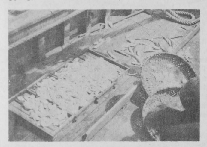
FIG. 6 - VIEW ABOARD A MANILA BAY TRAWLER SHOWING THE TRAYS ON WHICH THE FISH ARE HANDLED.

One of the most important salted products is "bagoong," a type of fish paste. It is an important flavoring material widely used in the preparation of vegetable dishes. Some people often partake of meals consisting of rice, vegetables, and bagoong, the latter serving as the sauce which makes the vegetables more palatable.