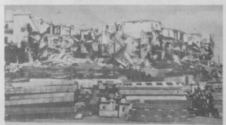
FIG. 2 - WAR DAMAGE IN MANILA. NEW BRIDGE STEEL IN FOREGROUND.

of fishing supplies, principally net twines and fish nets, promoted the brisk resumption of many fishing activities—both commercial and subsistence fishing.