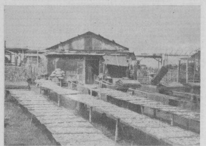
FIG. 9 - VIEW OF FISH DRYING AT NAVOTAS SHOWING THE FISH SPREAD OUT ON TRAYS.

All these plants were destroyed during the war and it is not known when their reconstruction will be accomplished, if at all. The laboratory canning plant operated by the Program and a similar one by the Philippine Institute of Fishery Technology are, therefore, the only places where studies on canning of fish are now being conducted. The National Development Company, a government-