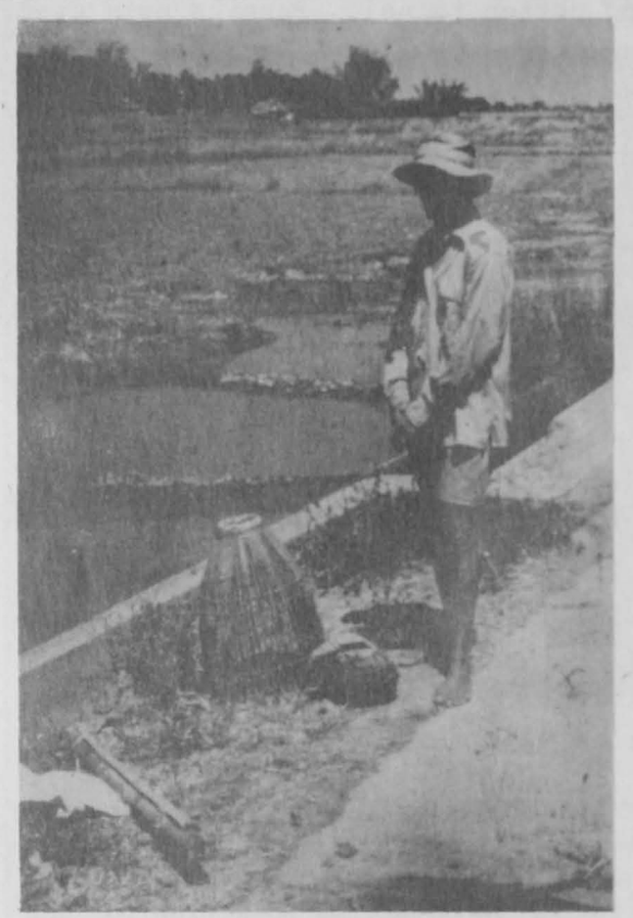
FIG. 5 - TYPICAL RICE PADDY FISHERMAN

The Navotas landing is located about 8 miles by road north of the center of Manila. The market consists of a series of sheds 200 yards in length built just