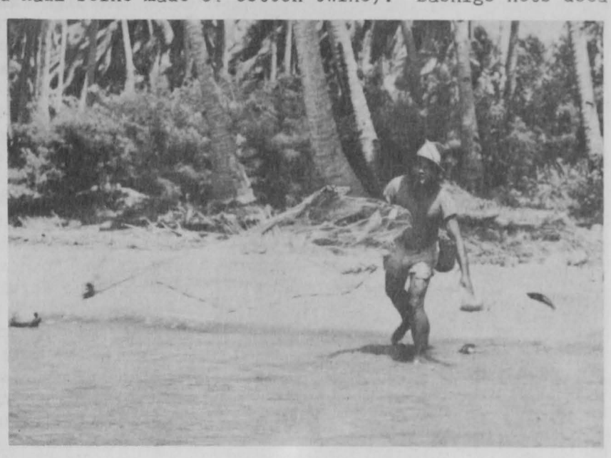
FIG. 4 - FISHERMAN CASTING HIS NET

A large percentage of the fish taken in the Philippines is obtained by dynamiting. To supply the Manila markets, PT boats are used as fish carriers, their