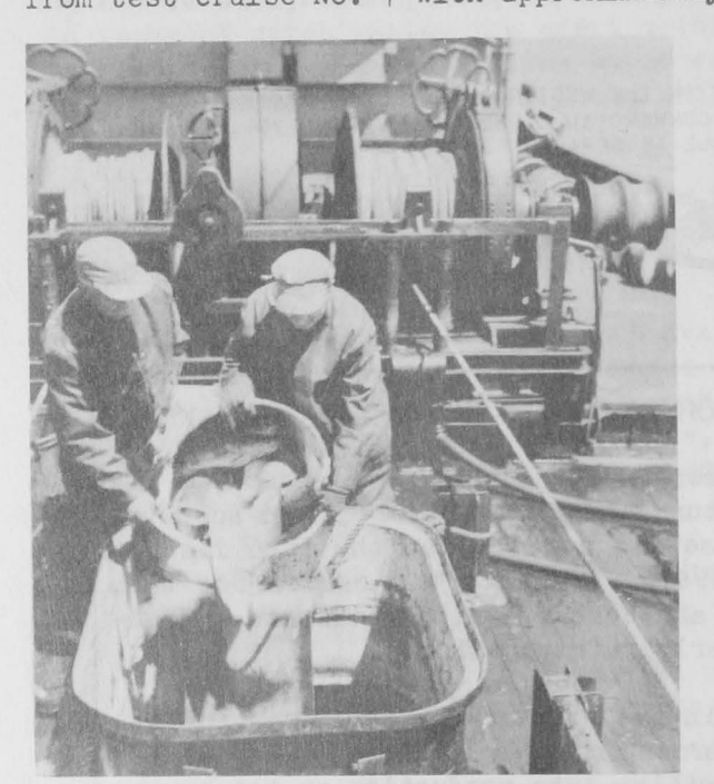
FEEDING FISH ONTO CHUTE LEADING TO BRINE-FREEZER AREA ABOARD THE DELAWARE.

REFRIGERATION: Freezing-Fish-at-Sea, Defrosting, Filleting, and Refreezing the Fillets: The research trawler Delaware returned to East Boston on May 12 from test cruise No. 7 with approximately 12,000 pounds of haddock. Half of the