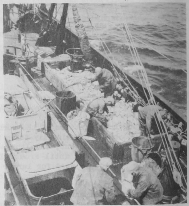
SORTING FISH ABOARD THE RESEARCH TRAWLER DELAWARE.

fish was brine-frozen in the round at sea; the remaining half was packed in ice in accordance with normal commercial practice. Part of the frozen fish was processed in a local plant in order to obtain data on fillet yields. Another part of the frozen fish was placed in cold storage and will be used to study the effects of prolonged storage of the round frozen fish on quality of the fillets, prepared by thawing these whole fish, filleting, and refreezing the fillets. The remainder of the fish is being used for dockside tests of the refrigeration equipment. (Boston)