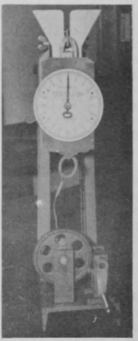
Fig. 4 - Tenderometer used for measuring texture changes in the meat of fish.

ORGANOLEPTIC RATINGS: The palatability scores (based on appearance, flavor, and texture) for fillets from very fresh scrod haddock and haddock showed little decrease with increased salt content (table 1). In the case of fillets of fish that were brine-frozen at sea and stored for 1 week and for 18 weeks prior to being processed, the drop in flavor scores (table 1) due to excessive saltiness was apparent. However, where an optimum quantity of salt was present, the flavor scores of both groups of fillets