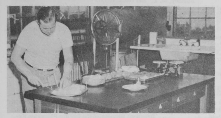
Fig. 5 - Preparation of fillets for organoleptic tests.

from brine-frozen fish were in the same range as those of the freshest iced fish. The flavor scores, in the case of the fillets from fish iced up to 10 days, apparently