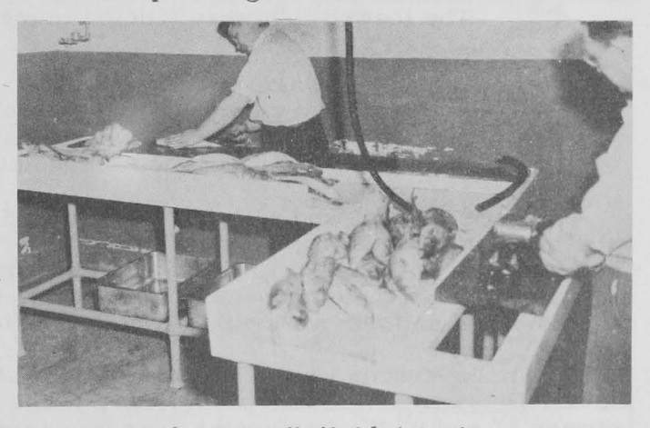
Fig. 1 - Scaling and filleting scrod haddock for brine-dipping experiments.