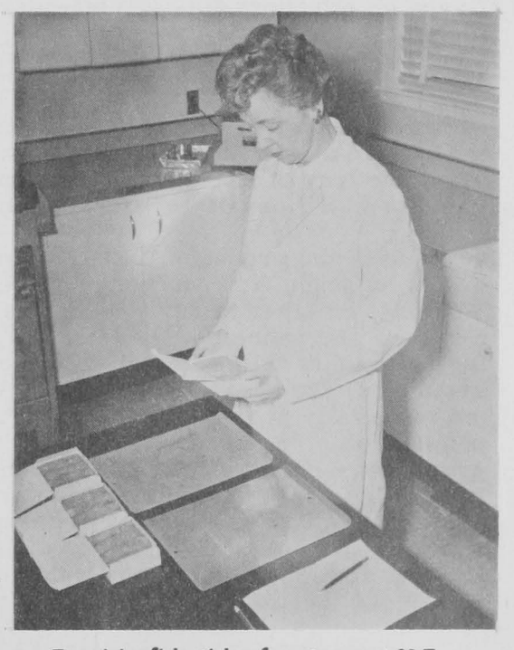
Examining fish sticks after storage at 0° F.

PREPARATION OF FISH STICKS: The fish sticks were prepared commercially from the fish blocks at a local plant. The blocks were cut into fish sticks with a band saw; the fish sticks were covered with batter and breaded with standard commercial ingredients,