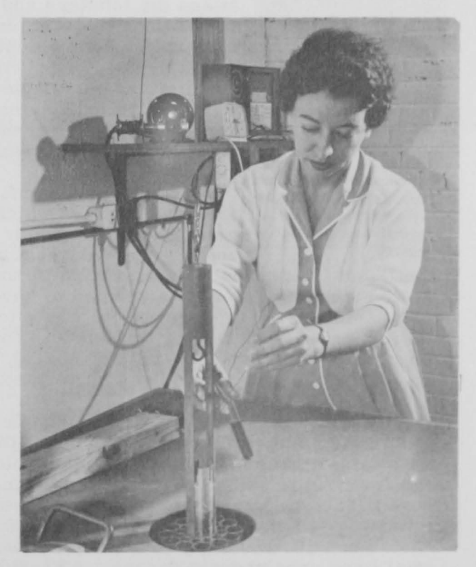
Placing oysters in equipment for sterilization by gamma radiation.

The work during the second year has been expanded at Louisiana State University, with four lots of oysters being prepared for frozen storage tests in contrast with one in the first season. Florida State University reports unexpectedly encouraging results in the latest experiments on sterilization of oysters by irradiation with Cobalt 60. The thiobarbituric acid tests have also been developed to give a quite satisfactory method of following oxidative rancidity affecting quality of stored oysters. They expect to develop many more cooked oyster products and dishes for frozen storage