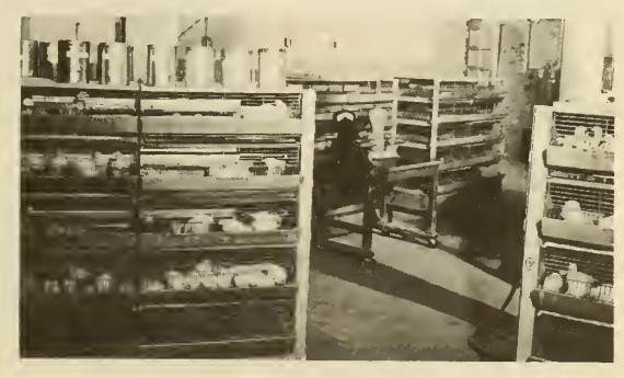
Fig. 1 - Battery room in the Poultry Husbandry Department of the University of Wisconsin where fish meal assays are conducted.

present work is given in their article. In the present experiments, soybean protein was used as the source of protein, and sucrose was used as the source of carbohydrate. Supplements were added at the expense of the sucrose. Chicks were fed the diet with or without supplement from the time that they were 1-day old to the time that they were 4-weeks old. The chicks used were obtained from hens that were kept in wire cages and artificially inseminated. The diet of the hens was a good complete breeder mash. In these assays,