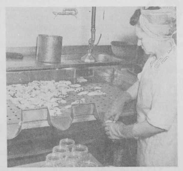
FIG. 3 - PACKING SHUCKED OYSTER MEATS INTO JARS.

Most of California's oyster harvest comes from Eureka, where 250,000 gal-