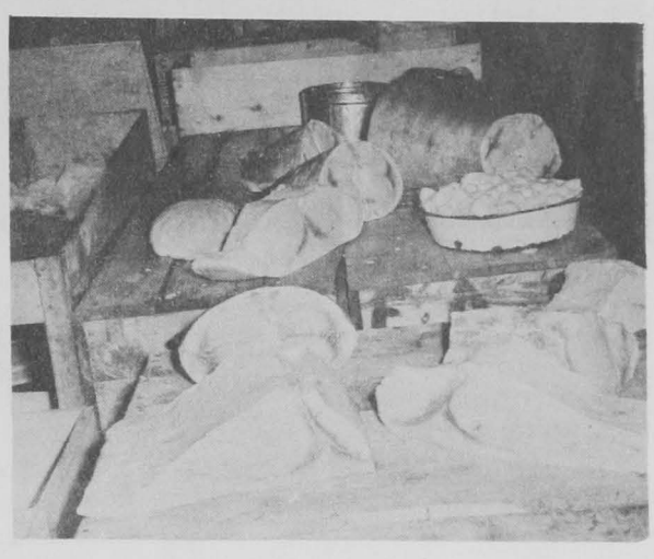
CHUNKS OF FRESH CANADIAN SWORDFISH ON DISPLAY AT FULTON FISH MARKET, N.Y.C.

Fresh processed fish and shellfish prices in January 1958 were lower by 2.7 percent as compared with the preceding month. Lower wholesale prices for fresh haddock fillets (down 16.6 percent) reflected the decline in ex-vessel prices for drawn haddock at Boston. Due to more plentiful supplies of shucked oysters this season as compared to last, wholesale prices showed signs of weakness with a decline of 2.1 percent from December 1957 to January 1958. Prices for fresh 26-30 count headless shrimp remained high and unchanged from