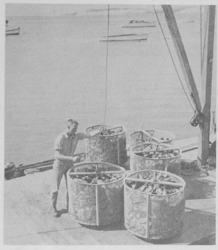
FIG. 1 - HEAVY WIRE BASKETS LOADED WITH OYSTERS LANDED FROM THE BOATS.

So far the vigilance in California has paid off, as the drill problem does not exist to cause loss of producing oysters and bottoms.