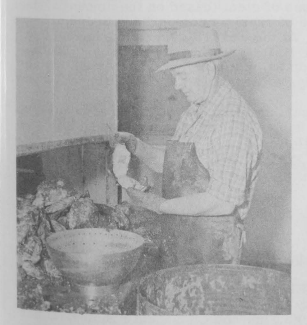
FIG. 2 - SHUCKING OYSTERS AT MORRO BAY, CALIF.

Production has grown in recent years. In 1948 only 166,000 pounds (in-shell weight) of oysters were harvested. In 1956 6,000,000 pounds were dredged by the rejuvenated industry which is still growing.