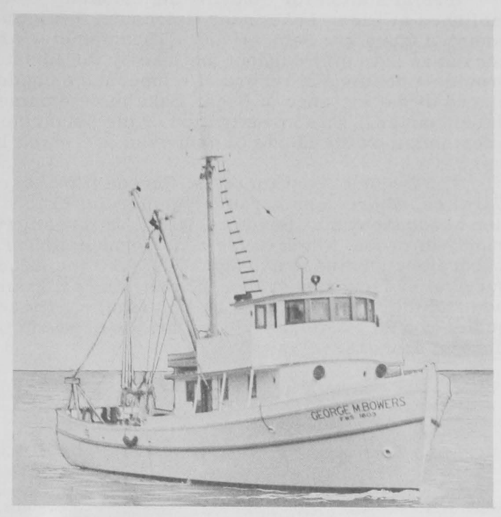
THE SERVICE EXPLORATORY FISHING VESSEL GEORGE M. BOWERS.

Radar tracks were made of the courses of three vessels (55-58 feet) over varying periods of time. On most legs of these tracks, which were plotted at 5-or 10-minute intervals, speeds were later determined to have been between 3.0 and 3.3 knots. The lowest speed observed, for one 10-minute period, was 2.5 knots; the highest, 3.6 knots. All three of these vessels were towing two (40-42 feet) flat trawls (double-trawl rig).