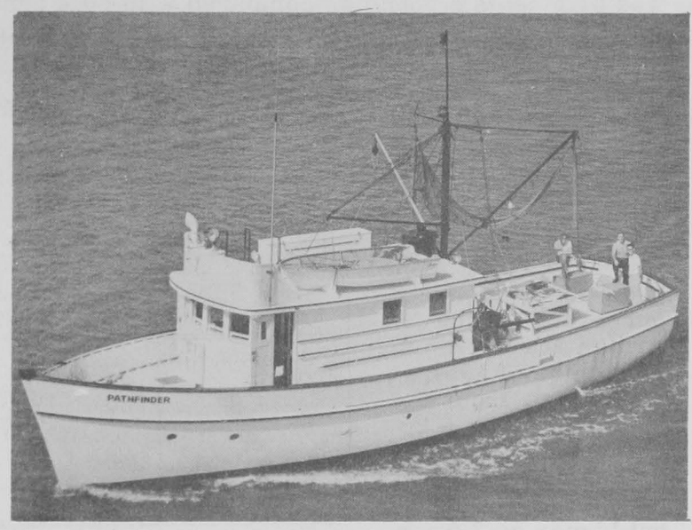
VIRGINIA'S FISHERIES RESEARCH VESSEL PATHFINDER.

In the upper part of the Bay, scientists found numbers of small croakers and striped bass. Some