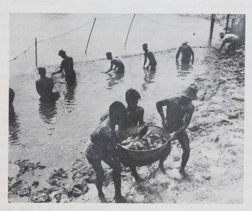
THAILAND: Harvesting tilapia from a fish farm.