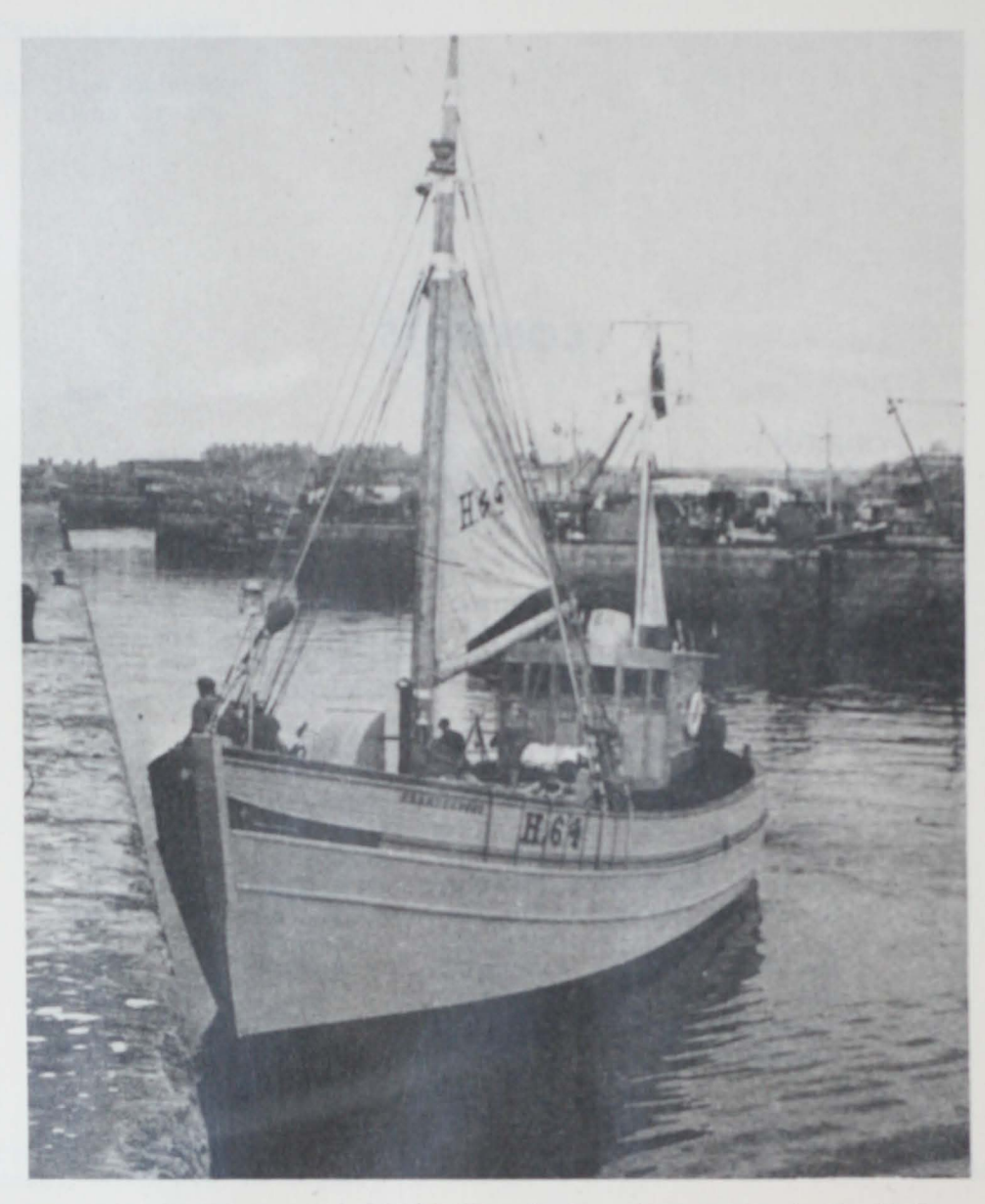
The 66-foot seine netter, M/V 'Skanderborg', operates in North Sea. Vessel is owned by Boston Deep Sea Fisheries of Hull, England.