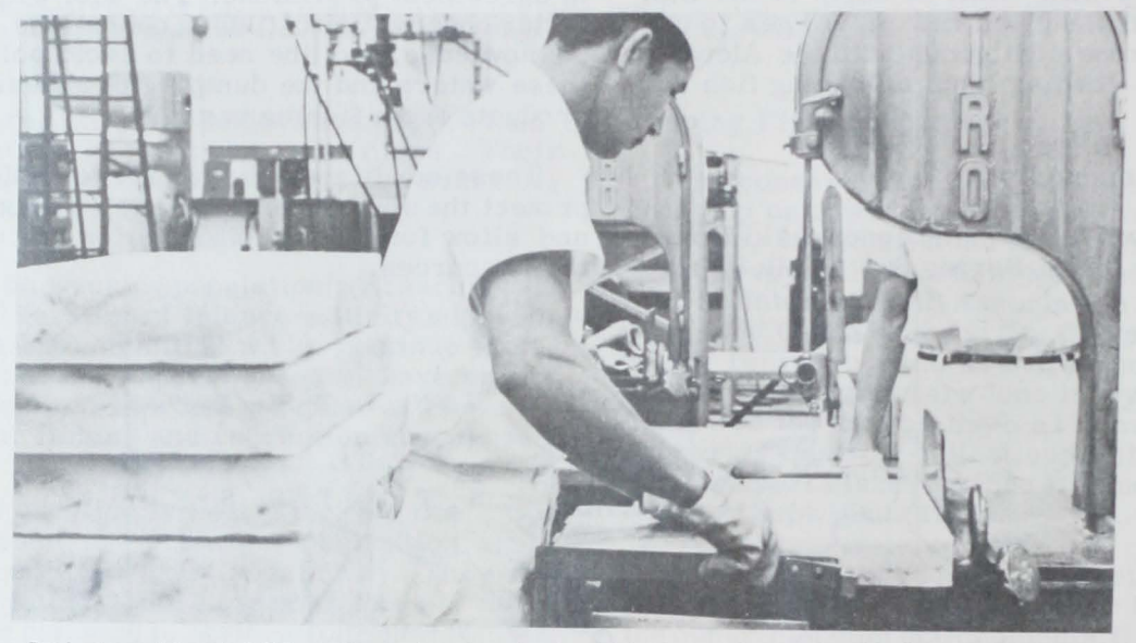
Production of breaded fish portions. A series of cuts with high-speed saws turns blocks into uniform portions desired.

were 33% ahead of the year-earlier period. There is a wide price spread between lowerpriced blocks--ocean perch and pollock, for example--and higher-priced flounder. Cod, the largest proportion of block imports, is also relatively high priced. Imports of the lower-priced species have been increasing as a percentage of the total; they offer a lessexpensive product in a period of rising prices. The output of products, restricted by the shortage of blocks in 1971, increased 15% through first-half 1972 over a year earlier. Inventories of blocks were up 35%.