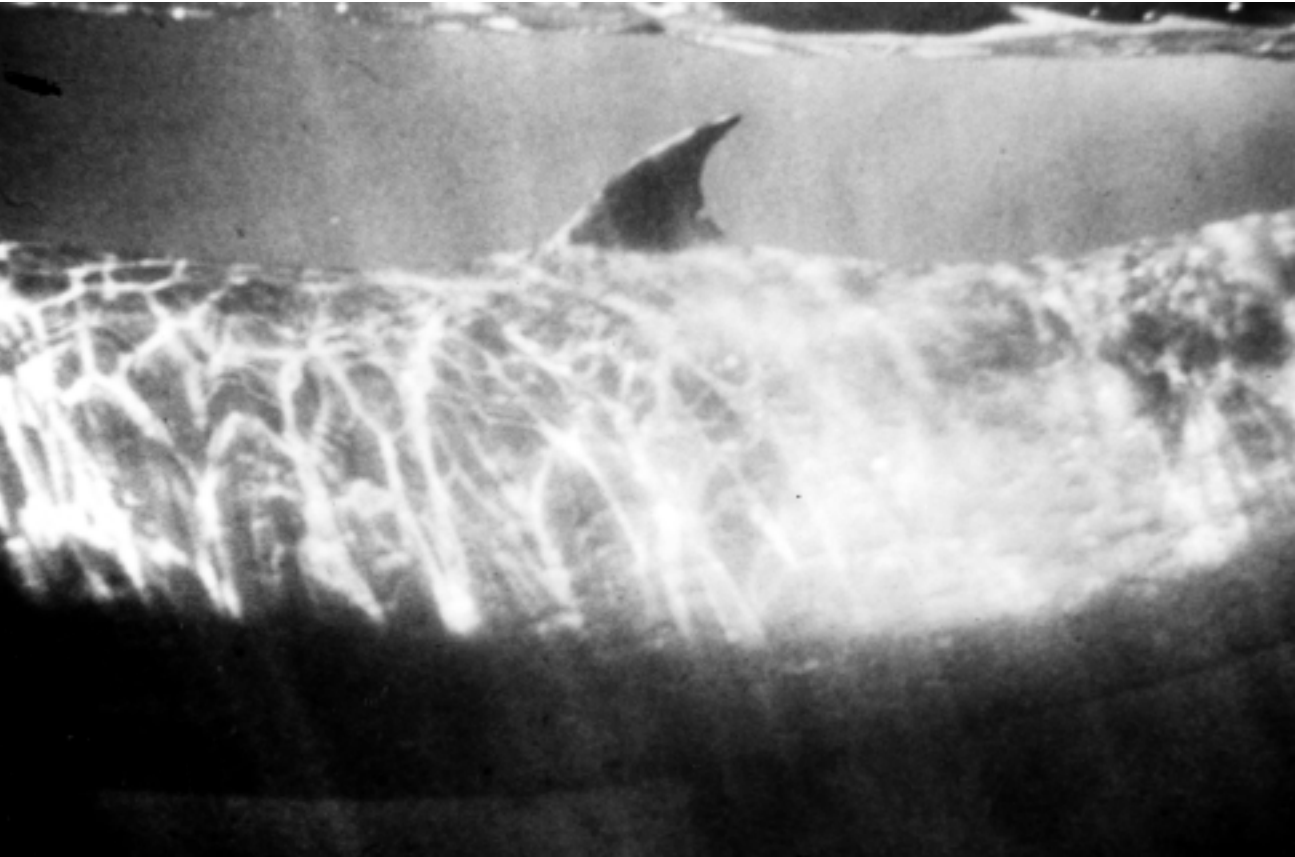
Figure 30.—Underwater views of a sei whale.