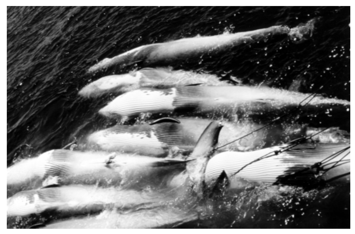
Figure 33.—A raft of harvested sei whales.

Information on natural mortality in sei whales is scant. The estimated an-